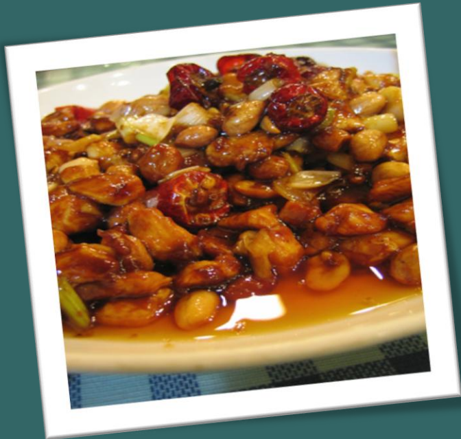
Kung Po Chicken